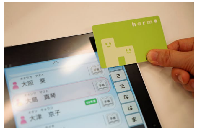
Safely and securely managing patients' information and their medication records

and Welfare has officially recognized "harmo Medication Notebook" as a digital medication record service that meets its guidelines. "harmo" enables patients to manage their own medication history, while hospitals and clinics can use the stored information to conduct examinations and issue prescriptions more efficiently. Since its launch in 2011, the service has grown to approximately 450,000 users across Japan.