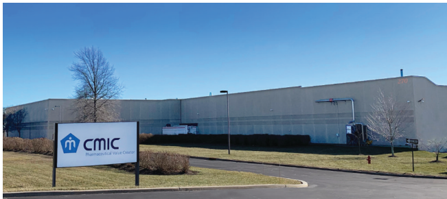
270 Prospect Plains Road Cranbury, New Jersey 08512